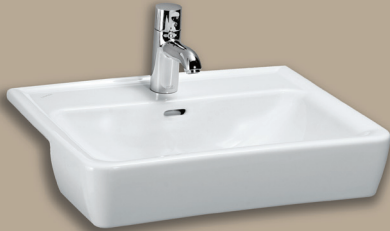
Approved by the Department of Health Excluding tap