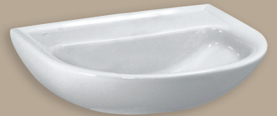
Approved by the Department of Health Excluding tap